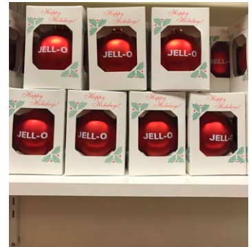
Great stocking stuffers, or a present for someone who has everything