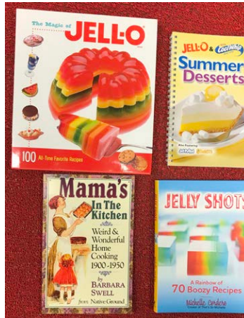
Cookbooks which include many Jell-O recipes