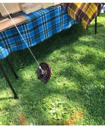
Did Lapp Insulator make dishes? These tent tie downs at the Oatka Festival are an interesting use of old Lapp Insulators.

45. Jell-O made Zowie. bean, not the string bean. 44. He developed the string-less of the Union Free School. 36. It was the high school win. WW II for scrap. 27. They were dug up during it's bicentennial until 2034. 20. The Village won't celebrate .msəi 19. The Ibexes were a baseball .911d 16. No he didn't die of a tick Webster. 15. She was married to Daniel a foundry on Bacon Street. 9. Bacon manufactured stoves in ry Clay of Kentucky. 7. Clay Street is named for Henpresident. 6. Benjamin Franklin was not a atin for a while. 4. Jell-O sold cola flavored gel-These are talse: Most of the questions are true.