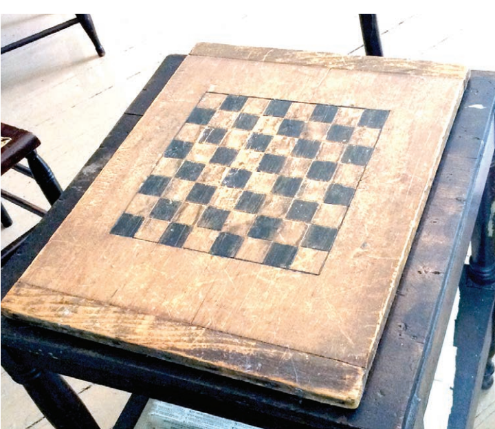
Checkerboard painted on old breadboard.

Giveaway Checkers is played like regular checkers, except the object is to lose all of your pieces, so plan to move your pieces directly in the way of your opponent's pieces, so your pieces have to be jumped - - the more pieces jumped by your opponent, the better.