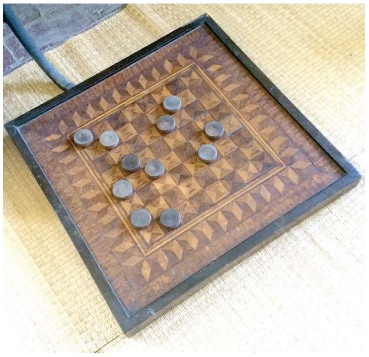
Checkerboard made of inlaid wood.