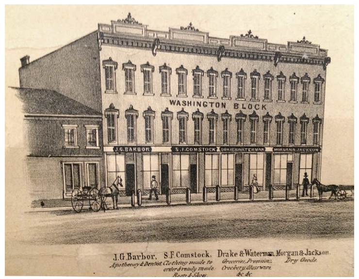
1856 image of the Washington block.

Through the years, the front facades of the Washington Block have changed and doorways have moved. Batavia Optical "modernized" the lower windows on the west side of the building. The windows were filled in and plastic clapboard siding was installed. The west side of the building is owned by the LeRoy Living Waters Church. They have wanted to restore the storefront to something similar to what was there before, but it is an ex-