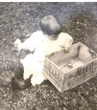
Girl with Jell-O box.