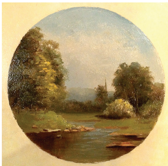
Scene of the Oatka Creek with St. Joseph’s steeple in the background.