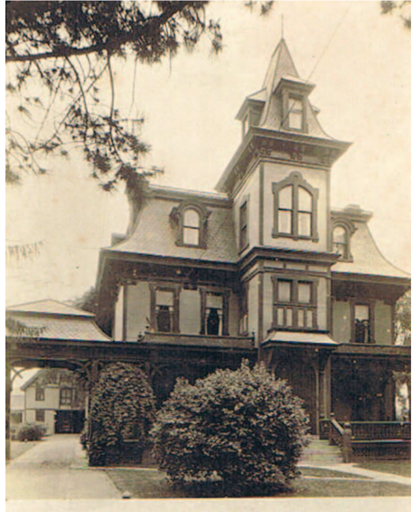
themselves." Olmsted Dreamland - Home of Schuyler Wells - destroyed by fire.

Olmsted went to the old Buffalo Foundry on Broadway in