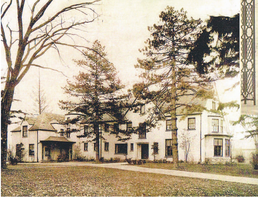
118 East Main Street circa 1930.