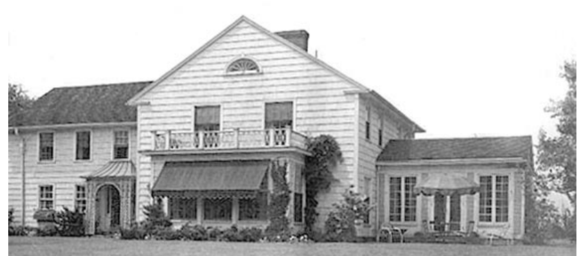
Photograph from 1940 Book. #141 East Main Street, designed by Arnold, built in 1924.