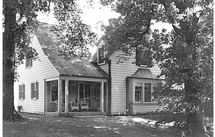
Photograph from the 1940 book, #7 South Street. The former home of Ernest Woodward's stable master. Built in 1928.

agreed to come to LeRoy for a program later this year.