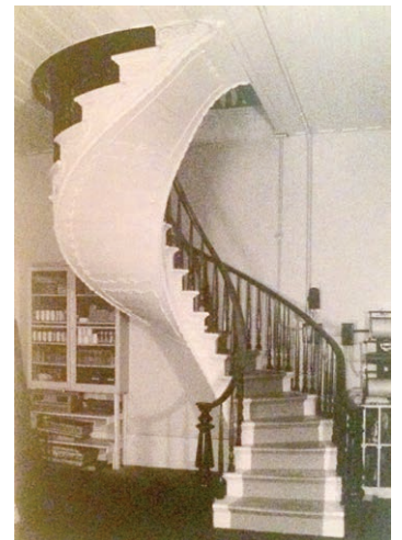
Staircase in the Steuber Store on the corner of Mill & Main. 1940 LeRoy Book (staircase torn out).