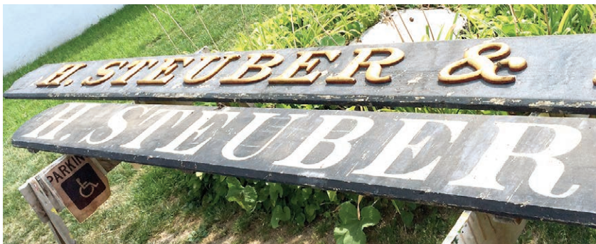
Two Steuber signs now at the Historical Society.