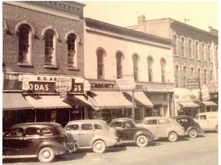
Steuber building (with 5 windows) now the Hobby Horse.