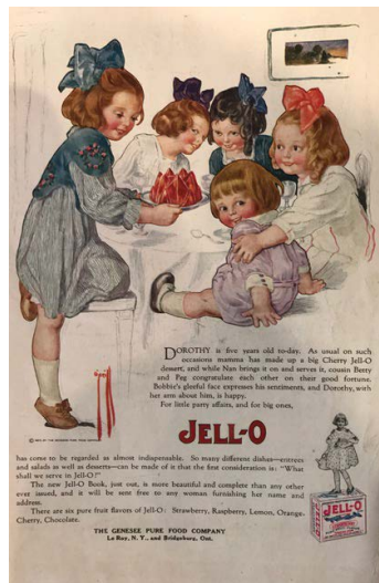
Color ad by Rose O'Neill