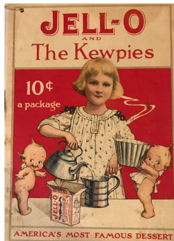
Rose O'Neill and the Kewpies

commercial products and created illustrations for magazines such as Scribners, The Home Companion, and the Saturday Evening Post. There were several talented women who illustrated for Jell-O. A career as an illustrator attracted many women in the post-Victorian society. Although many educational opportunities were not offered to women, they were allowed to study art and sketching in school. This profession also allowed women to work in a studio in their home which was perfectly acceptable. Never the less, these women had to have talent and tenacity to compete in the commercial art field.